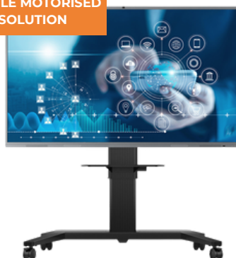
MOBILE MOTORISED SOLUTION