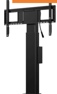
MOTORISED FIXED FLOOR STAND

The perfect Solution for every classroom!