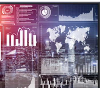
INSTALLED WALL MOUNTED